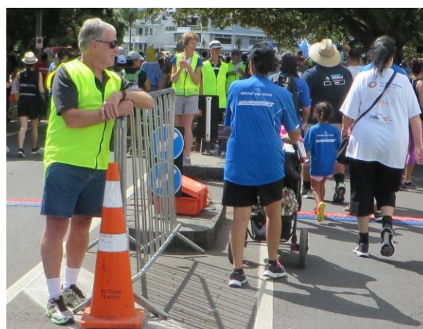
Bumper - a reasonably formidable human safety barrier at the entry to the finish chute.